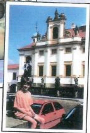
Prague trip 2005