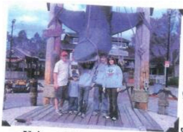
Universal Studios Florida 2005