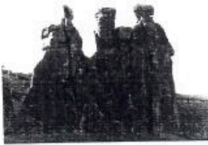
The Three Wise Men (as perceived and photographed by Sue at Moab National Park in Utah)*