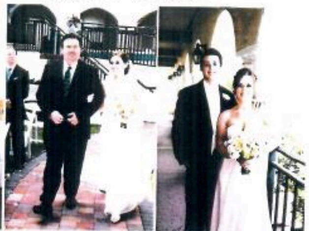
The big day!